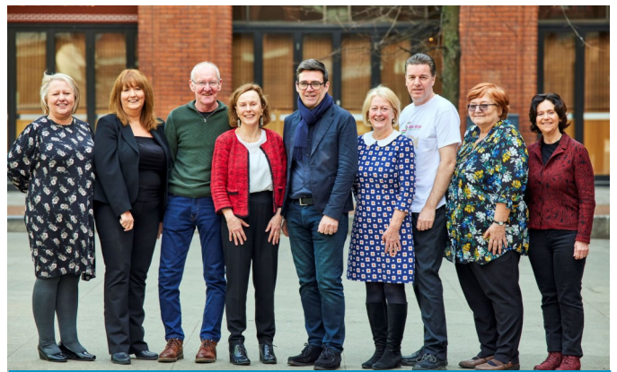
Consortium chiefs with Andy Burnham at the SoundPound loan launch earlier this year

You can find more information about the investment fund as well as other sources of investment and how to apply on GMCVO's website: gmcvo.org.uk/gmsocinvest .