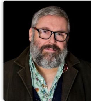
Pete Johnson Platform