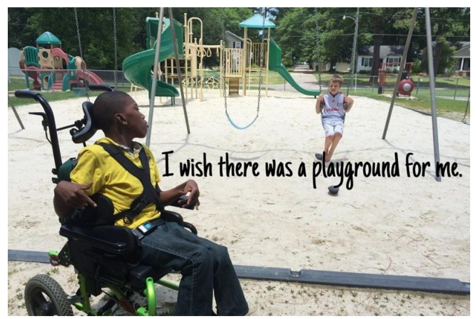
An inclusive society???

For disabled people, many workplaces and leisure facilities are inaccessible, there is very little choice of where to live and the public spaces through which people need to move can be full of barriers.