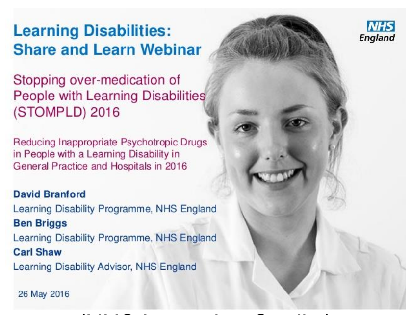
(NHS Improving Quality)

The UK's National Health Service is one of the best health care systems in the world for health outcomes and value for money, outperforming most other global systems. It is a democratic service offering universal health care to all. It addresses health inequality like no other health service. Disabled people have access to good quality medical treatment according to need, not according to their ability to pay.