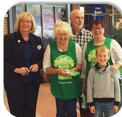
Collecting at a supermarket

Giving to foodbanks couldn't be easier. Many supermarkets, shops and community buildings have permanent collection points in place and, if bigger collections are organised (at a school or business) foodbanks are delighted to arrange a pick up. The 'what to give' is an important question. The Trussell Trust provides lists to all foodbanks so that volunteers know what to put into a parcel to ensure consistency and nutritional balance. Extra items are also suggested so that toiletries and treats can be added to parcels when available. The general shopping list is available here . Beans, pasta and tea are generally in abundant supply at foodbanks so instead of donating these items, you could perhaps consider buying one of the following: Long-life milk or juice; Tinned meat, fruit or veg (especially potatoes); Cereal; Instant coffee; Sponge puddings/Rice pudding and custard.