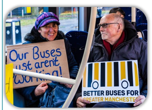
Protesting against the current bus service!

37% of Greater Manchester's job seekers said that <u>lack of access to transport is a key barrier to getting work</u>, backed up by <u>JRF research in low-income neighbourhoods in Manchester</u>. This is in one of the UK's biggest and best city regions.