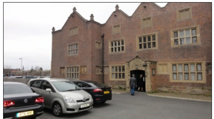
Ample parking front and rear

Hough End Hall comprises 6,278 sq ft, arranged over basement, ground and first floors