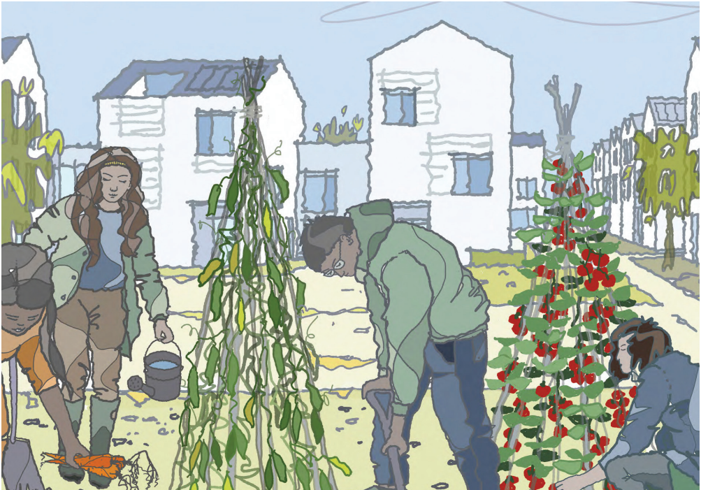
How the North Manchester General Hospital might look