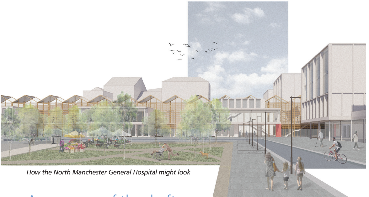
How the North Manchester General Hospital might look

A summary of the draft Strategic Regeneration Framework for public consultation